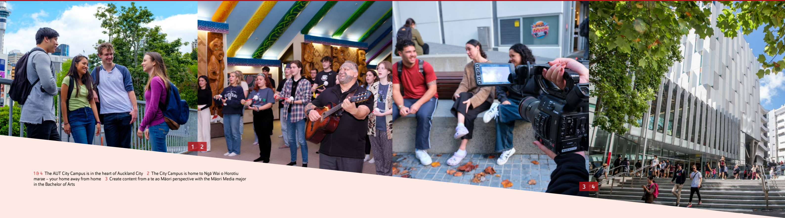
1 & 4 The AUT City Campus is in the heart of Auckland City 2 The City Campus is home to Ngā Wai o Horotiu marae – your home away from home 3 Create content from a te ao Māori perspective with the Māori Media major in the Bachelor of Arts