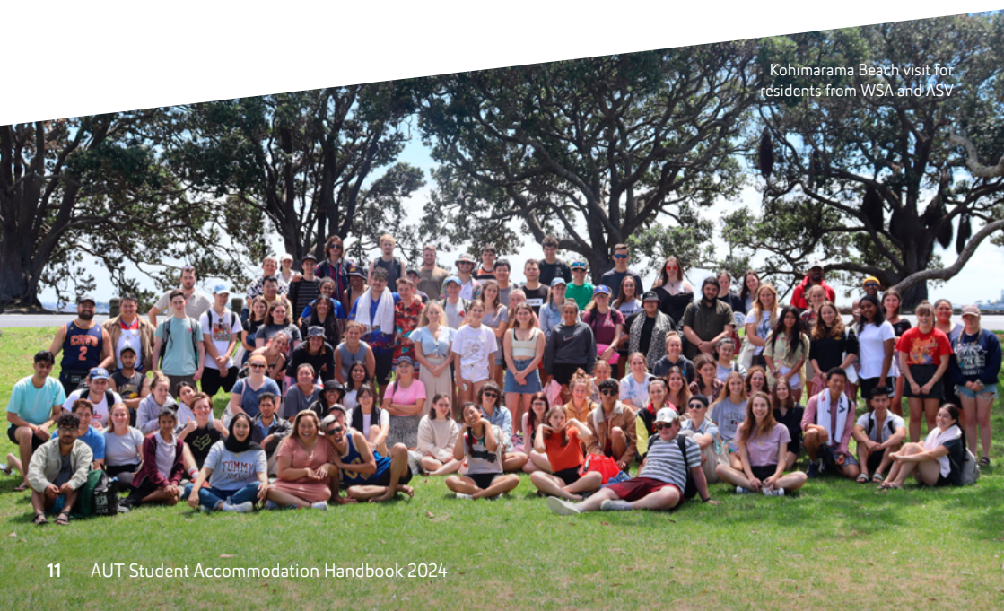
Kohimarama Beach visit for residents from WSA and ASV

You will be asked to record all pre-existing damage within 24 hours of arrival so that you won't be charged for it when you move out. More information on how to submit this will be provided when you check in.