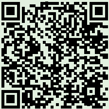
*Scan QR code for postgraduate health science courses.