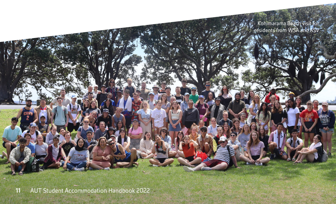
Kohimarama Beach visit for residents from WSA and ASV

You will be asked to record all pre-existing damage within 24 hours of arrival so that you won't be charged for it when you move out. More information on how to submit this will be provided in your welcome pack.