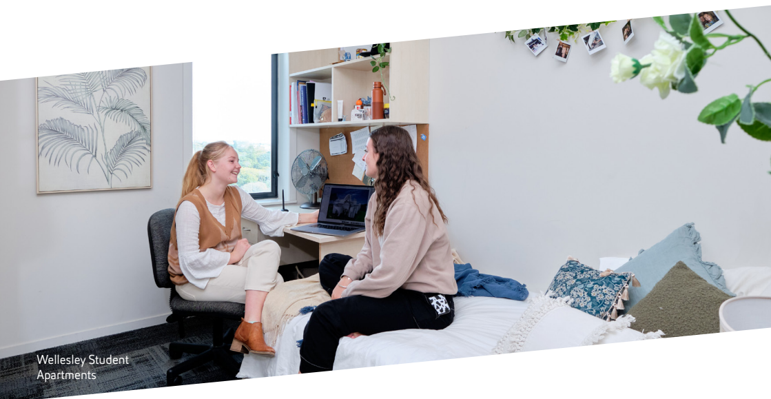
Wellesley Student Apartments

You can also contact your residential team on: residential.services@aut.ac.nz