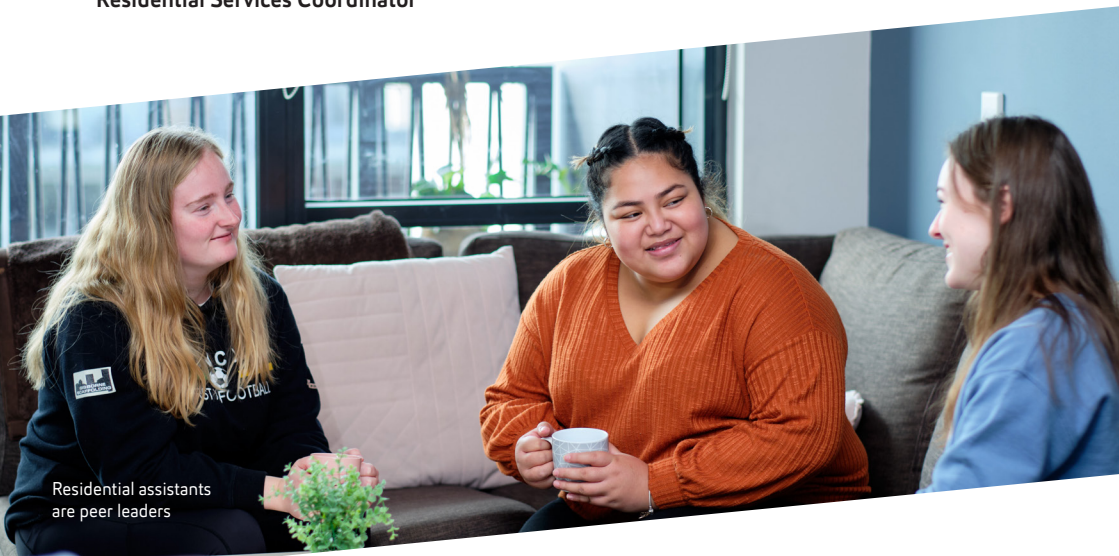
Residential assistants are peer leaders

Residential assistants are students trained as peer leaders who coordinate activities in our student accommodation. RAs have many roles and responsibilities, including building a residential community through programming events, acting as a mentor for students, and being a familiar first point of contact for students.