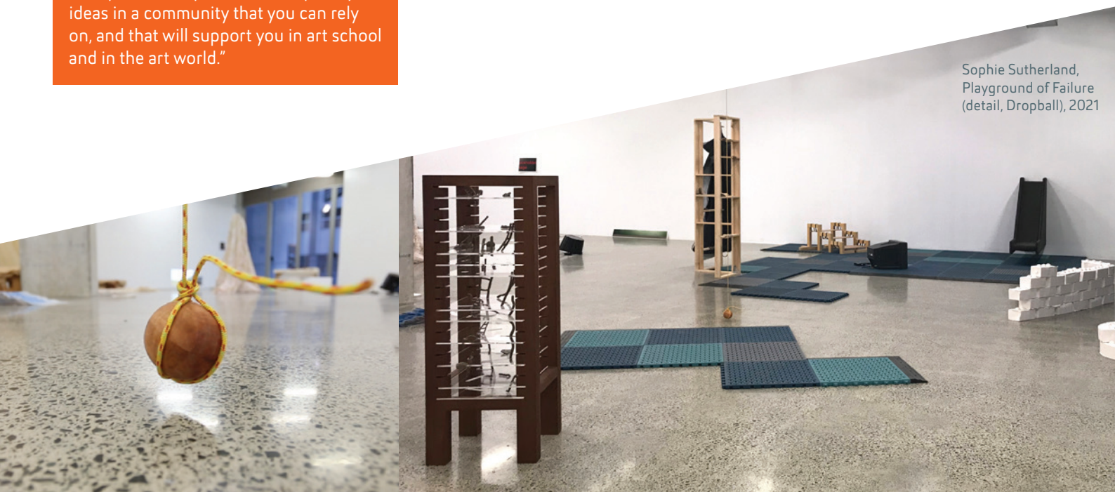
Sophie Sutherland, Playground of Failure (detail, Dropball), 2021

Once you've completed the coursework component, you will work with your appointed supervisor(s) to develop a research proposal to be undertaken in the Thesis, which is a full year of practice-led research.