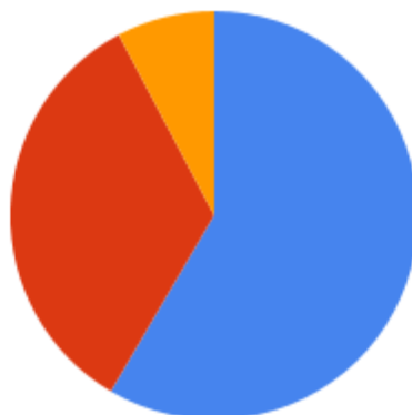
Source of Traffic - 2009 ytd

■ Search Engines (58.45%) ■ Referring Sites (33.79%) ■ Direct Traffic (7.75%)