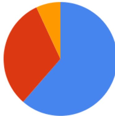
Source of Traffic - February 09

■ Search Engines (61.61%) ■ Referring Sites (31.72%) ■ Direct Traffic (6.67%)