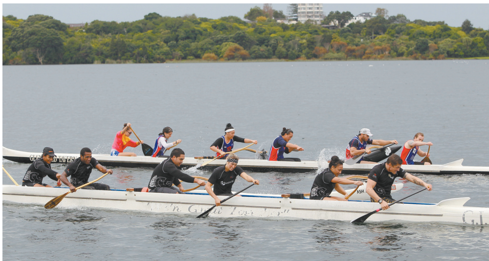
AUT University and Waiariki Institute of Technology battle it out in the Waka Ama.

In addition to the AUT Titans, more than 100 AUT student volunteers studying sport and recreation, business, physiotherapy