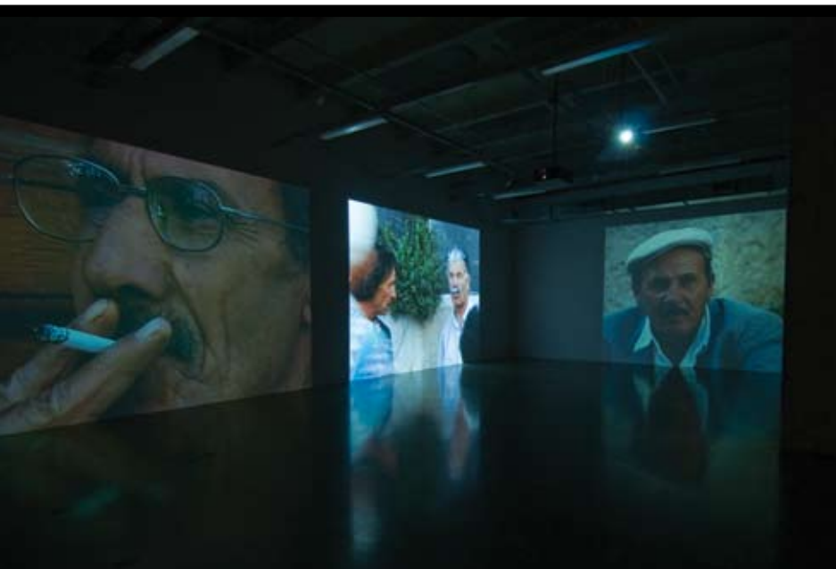
Below: Gary Hill, HanD Heard , 1995 - 96 Five-channel video installation, ST PAUL ST Gallery One Installation View, 12 March-24 April, 2009