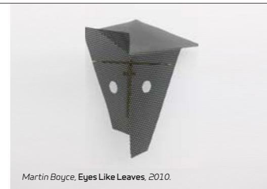
Martin Boyce, Eyes Like Leaves , 2010.

Tino Sehgal's work Instead of allowing something to rise up in your face dancing bruce and dan and other things has proven to be a compelling work worth multiple visits. An integral part of the work is the tension that exists between the audience and the interpreter, an electric feeling in the moment of connection that the interpreters also feel. With 11 different interpreters creating the live sculpture, each encounter with the work is subtly different. Sehgal's work can only be experienced during the exhibition, as he specifically bans documentation of the work. This prohibition is an integral part of his examination of the economy of art, where he produces gestures instead of objects, to circumvent the usual cycles of